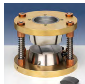
Segment pole caps