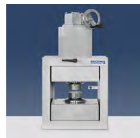
Electromagnet with heating poles

Measuring Technology for Soft Magnetic Materials Magnetizing Technology Services